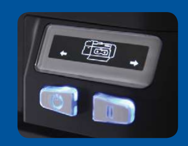
Both printers feature a high-resolution graphical SmartScreen<sup> \mathbb{N} </sup> display with a user-friendly interface that directs you through the entire printing process.

The FARGO® DTC4250e Direct-to-Card printer/encoder is ideal for mid-size organizations seeking to create brilliant employee access, membership, loyalty or photo ID cards. It's modular, scalable design simplifies equipment upgrades and migrations to higher levels of security and greater functionality. The FARGO DTC4500e Direct-to-Card printer/encoder is the number one choice for fast, high-capacity card printing and encoding of highly secure credentials. Choose custom overlaminates to create full-color cards that are virtually forgery resistant.